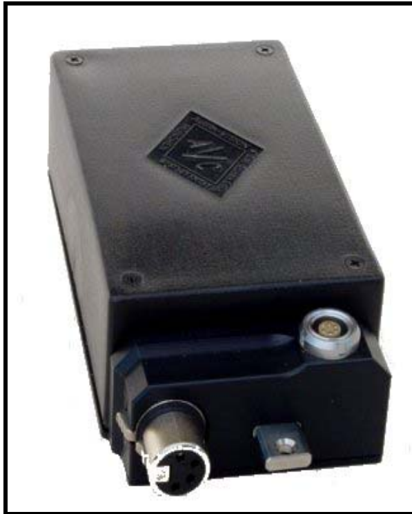
5113381 Power Pack 13,2V/3,8Ah 5112451 Power Pack 12V/4,5Ah